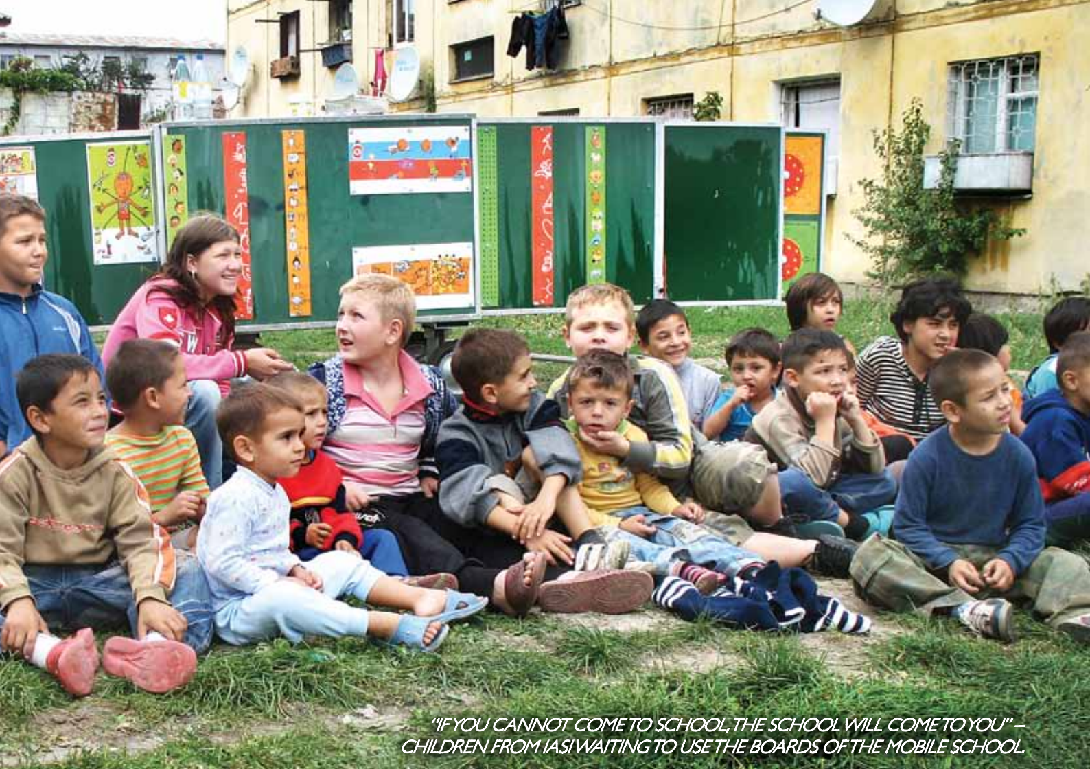
"IF YOU CANNOT COME TO SCHOOL, THE SCHOOL WILL COME TO YOU" – CHILDREN FROM IASI WAITING TO USE THE BOARDS OF THE MOBILE SCHOOL