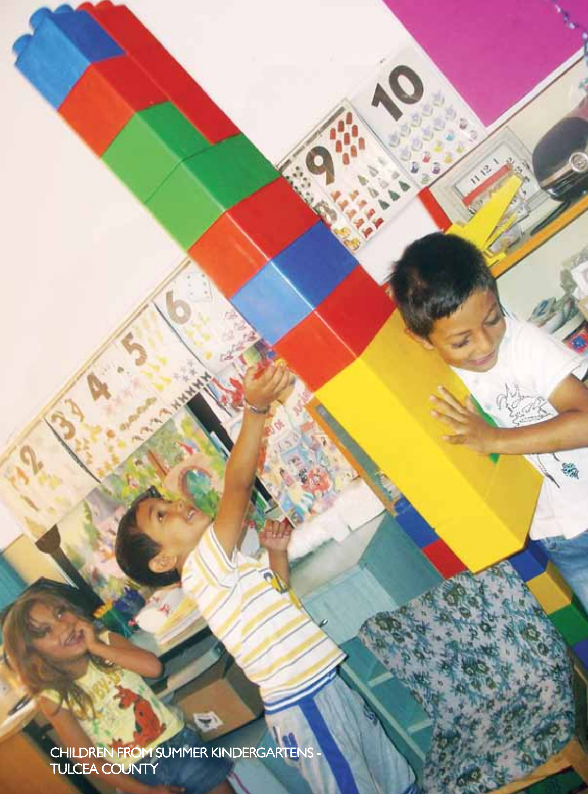
CHILDREN FROM SUMMER KINDERGARTENS - TULCEA COUNTY

Kaufland Romania also provided financial support for a national programme related to the promotion in schools and communities of child rights, health education and healthy lifestyle , which will be rolled out in 2014.