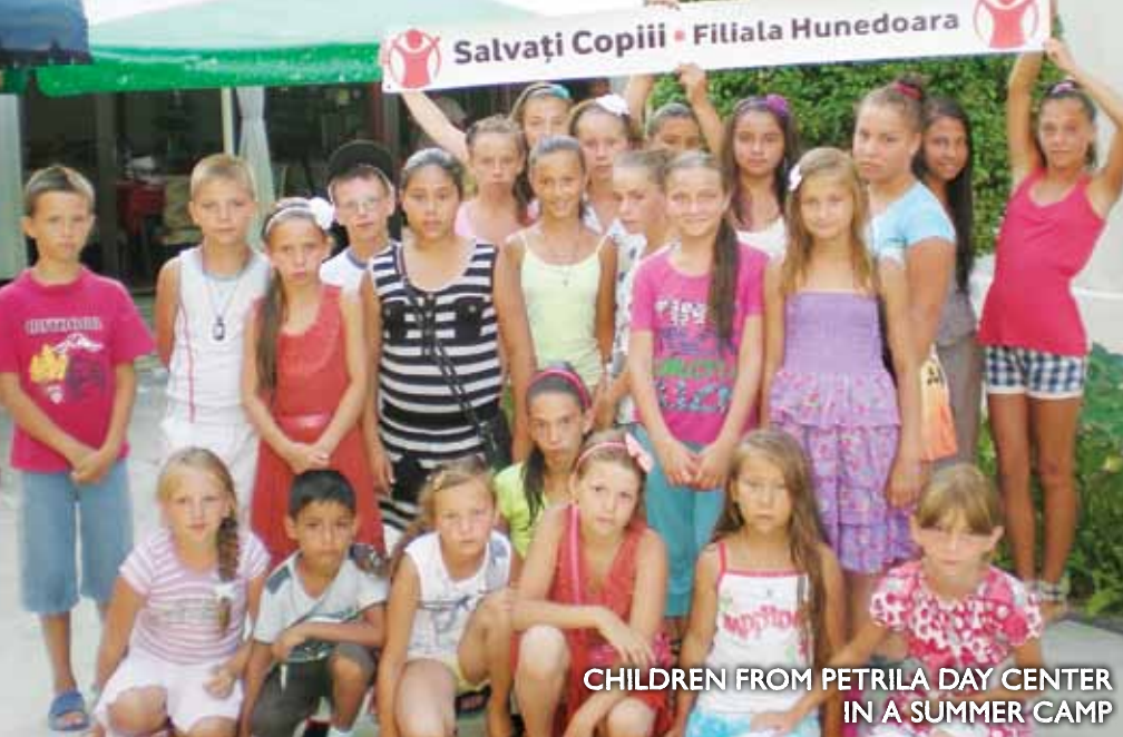
CHILDREN FROM PETRILA DAY CENTER IN A SUMMER CAMP